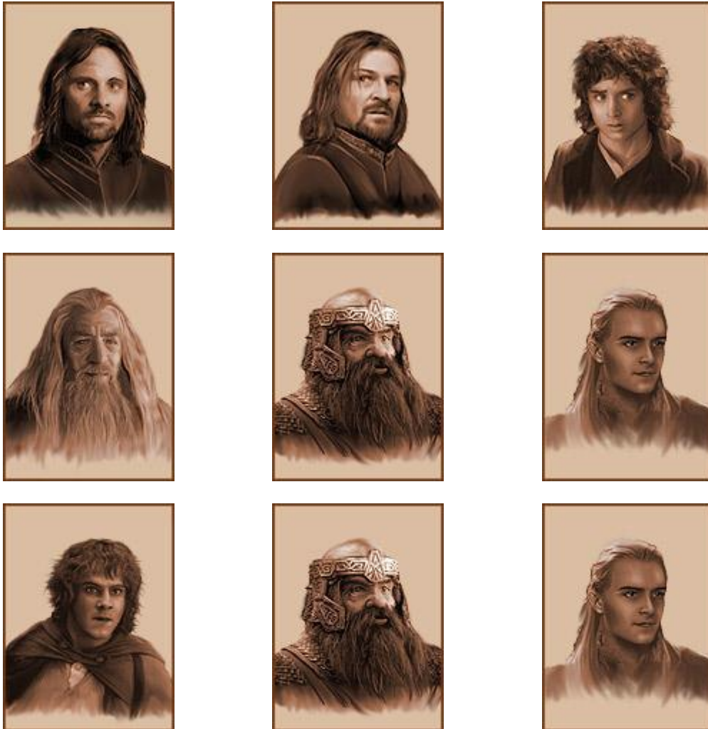
Figure 1: Fellowship of the Rings Characters

Below is the Fellowship of the Rings characters