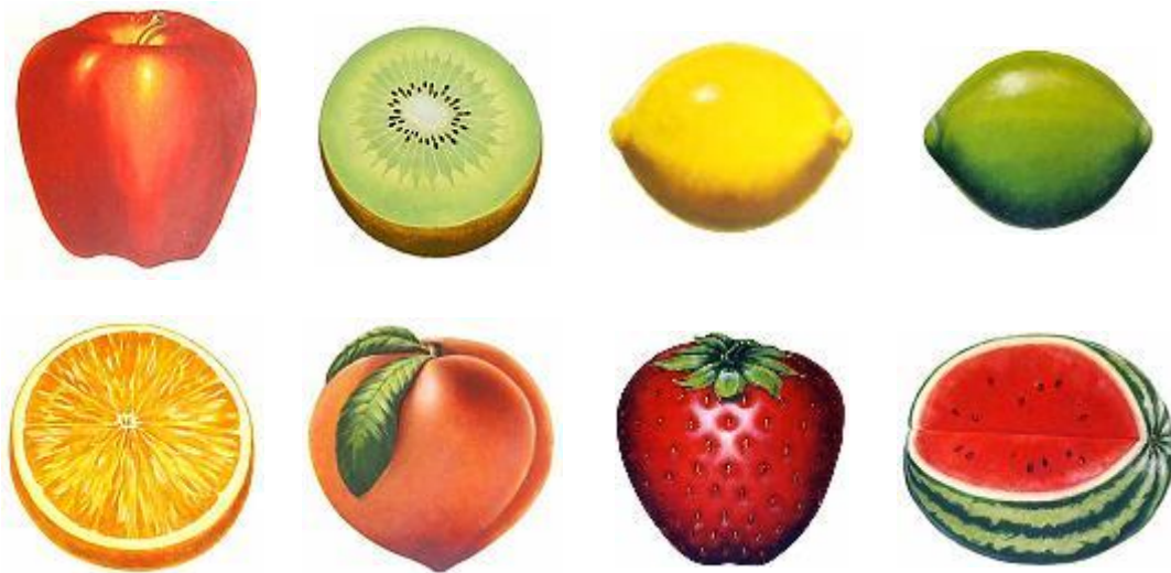
Figure 1: Collection of Fruits